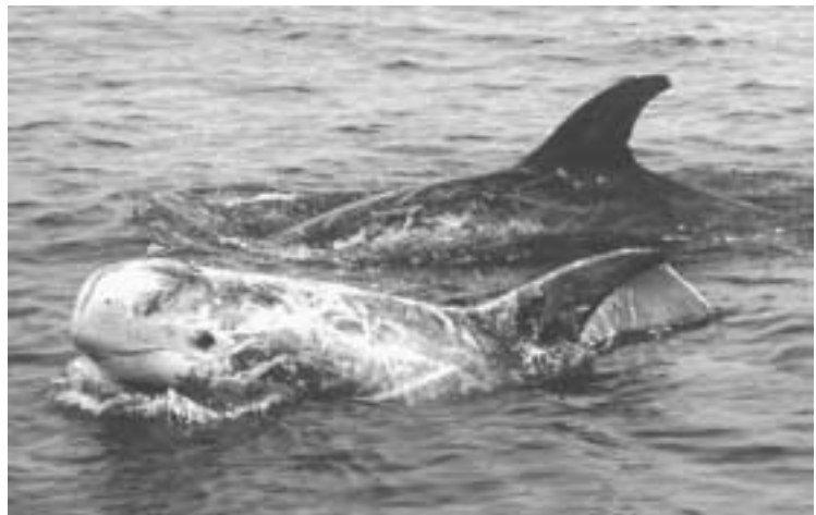
Figure 18. Risso's dolphins exhibit their typically piebald, or heavily scarred, appearance. These animals are fairly common in the Mediterranean Sea, including the Ligurian Sea Cetacean Sanctuary.

Lesser Antilles, and Indonesia. There is little information on population size or abundance (outside the eastern tropical Pacific).