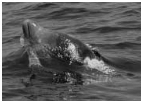
Figure 10. Beaked whales (Ziphiidae) are inhabitants of deep marine waters. They tend to be difficult to observe and identify, living as they do in small groups, spending much of their lives diving far below the surface, and sometimes appearing shy of boats. This animal, identified by the photographer as a Cuvier's beaked whale, approached a stationary vessel in the Flores Sea, north of Komodo National Park, Indonesia, October 2001.

Although the evidence for links between chemical pollutants and the health of cetaceans remains largely circumstantial and inferential, there is growing concern that exposure to contaminants can increase susceptibility to disease and affect reproductive performance. Odontocetes (toothed cetaceans) from many areas, particularly in the Northern Hemisphere, have large concentrations of organochlorines, organotins, and heavy metals in their tissues (O'Shea 1999; O'Shea et al. 1999; Reijnders et al. 1999; Ross et al. 2000). Polychlorinated biphenyls (PCBs) are of particular concern. These and some other organochlorines are known to interfere with both the hormone and immune systems of other mammals, and high levels (in excess of 100mg/kg) of these compounds have been associated with reproductive abnormalities and complex disease syndromes in some marine mammals (reviews listed above). Besides the possible indirect effects on populations resulting from reproductive impairment or reduced resistance to disease, some pollutants (or their breakdown and combustion products) are toxic, and high levels can be lethal. Reported levels of the conventional bio-accumulative pollutants in mysticetes (baleen whales) indicate that these animals are generally less contaminated than odontocetes, often by at