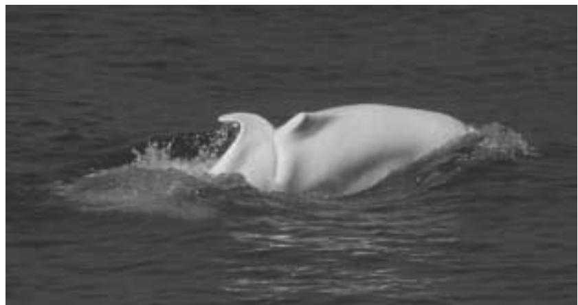
Figure 5. An Indo-Pacific hump-backed dolphin in Hong Kong waters, with a mutilated back presumably as a result of being struck by a propeller, or perhaps from an encounter with fishing gear.

It has long been known that collisions with vessels, even sail-powered ships, occasionally kill or injure cetaceans (Laist et al. 2001). However, the significance of these events has become much greater in recent years as marine traffic has come to involve larger, faster vessels infesting waters inhabited by remnant or dwindling cetacean populations. Kraus's landmark study of mortality and injury in North Atlantic right whales (1990) established the importance of ship-strikes as a factor endangering that small population. Ship-strikes also kill fin and sperm whales in the Mediterranean Sea (Cagnolaro and Notarbartolo di Sciara 1992), southern right whales in Argentina (Rowntree et al. 2001), and sperm whales around the Canary Islands (André et al. 1994). Vessel collisions are also a factor in the mortality of the endangered Hector's dolphins in New Zealand (Stone and Yoshinaga 2000), Indo-Pacific hump-backed