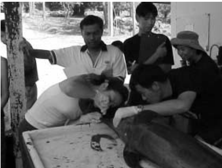
Figure 14. Capacity-building is crucial to the conservation of wild animals in developing countries. Here, Asian students and young researchers learn how to examine and conduct a necropsy on a dolphin carcass during an intensive training course in Thailand.

product can provide a practical framework and help demonstrate the program's usefulness to both participants and sponsors. Training programs that involve practical field or laboratory exercises can have multiple benefits by building capacity while at the same time contributing to scientific knowledge. One example of a project that successfully combined training with important research outcomes was the cooperative study of marine mammals of the Sulu Sea, involving scientists from Malaysia and the Philippines (Dolar et al. 1997).