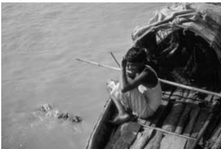
Figure 12. In parts of India and Bangladesh, the flesh and oil of Ganges River dolphins are used to attract schilbeid “catfish” ( Clupisoma garua ). Bound portions of meat, blubber, or entrails are trailed alongside the boat while a mixture of oil and minced dolphin flesh are sprinkled onto the water. When the fish rise to the surface within the oil slick, they are caught on small, unbaited hooks. This use of dolphin products creates an incentive for hunting dolphins and a disincentive for gillnet fishermen to release any that become entangled in their nets.

dolphins to supply bait for traps. The conservation implications for populations of Commerson’s, Peale’s, and Chilean dolphins ( Cephalorhynchus eutropia ) were highlighted in previous Cetacean Action Plans. Taking advantage of the availability of other sources of bait, preferably waste from slaughterhouses and fish plants, has been suggested as one option to reduce the numbers of dolphins killed (Lescrauwaet and Gibbons 1994).