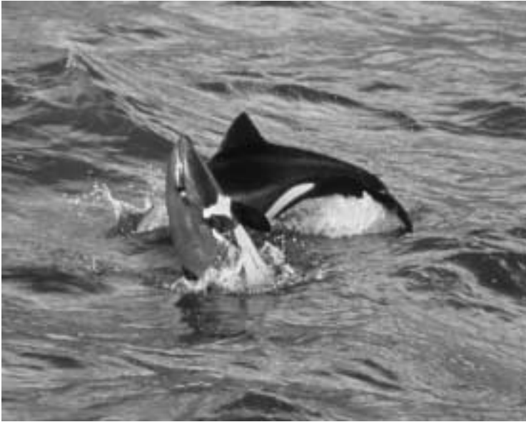
Figure 16. Heaviside's dolphins off the south-western coast of Africa, shown here, are among the more poorly assessed cetaceans. There is no abundance estimate for the species, nor is there reliable information on the magnitude of incidental or direct mortality.

evidence of a conservation problem for this species, but its restricted distribution alone makes it vulnerable (Peddemors 1999). At least a few animals are killed in gillnets, purse seines, beach seines, and trawls. Some are illegally shot or harpooned, apparently for their meat (Best and Abernethy 1994).