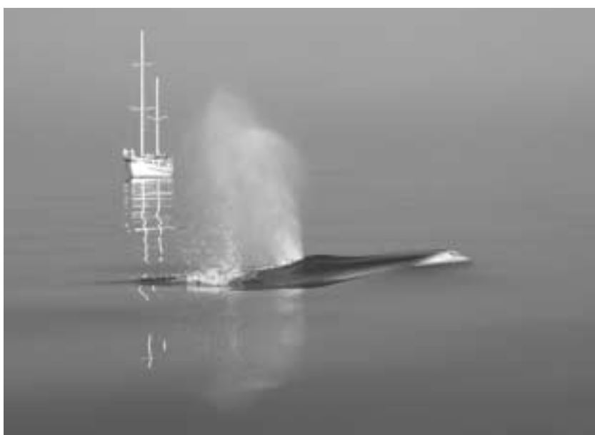
Figure 13. A fin whale surfacing in the Ligurian Sea Cetacean Sanctuary, Mediterranean Sea, with the research vessel “Gemini Lab” drifting in the background.

to recognize that they are only a single component of a suite of measures necessary to protect threatened species and populations.