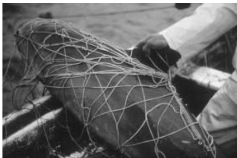
Figure 3. Large-mesh gillnets are deadly enemies of small cetaceans. Even when there is no reliable and consistent monitoring of the cetacean bycatch, merely knowing that these kinds of nets are used in an area inhabited by cetaceans almost guarantees that there is a problem with incidental catch. The vaquita (as shown here) is listed as Critically Endangered primarily because of mortality in such nets.

The significance of cetacean mortality in trawl nets (e.g., Couperus 1997; Fertl and Leatherwood 1997; Dans et al. 1997; Crespo et al. 1994, 1997, 2000) and longlines (Crespo et al. 1997) has only recently begun to be recognized. As an example, recent pulses in strandings of dolphins (particularly short-beaked common and Atlantic white-sided dolphins; Delphinus delphis and Lagenorhynchus acutus , respectively) on the western and northern coasts of Europe have coincided