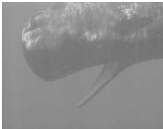
Figure 23. A sperm whale viewed underwater, with its mouth wide open, revealing the narrow lower jaw lined with teeth, and the massive head. The eye is visible in the upper right corner of the photograph, and the blowhole in the upper left, positioned asymmetrically on the left side of the top of the head. Near the Sangihe-Talaud Islands, a volcanic chain between northern Sulawesi (Indonesia) and Mindanao (Philippines), May 2000.

Sperm whales are cosmopolitan, occurring primarily in deep waters where they prey on squid (Figure 23). Their long history of commercial exploitation and continuing economic value (mainly as meat in Japan) make them a high priority for management. The IWC's moratorium has protected sperm whales from deliberate hunting since the 1980s, except at Lamalera in Indonesia, where a few to a few tens are taken each year with hand harpoons (612 landed from 1959 to 1994) (Rudolph et al. 1997), and the Lesser Antilles, where the St. Vincent and St. Lucia whalers take them occasionally (Price 1985; Reeves 1988). In 2000, Japan initiated a "scientific research" hunt for sperm whales in the North Pacific. Sperm whales die fairly often from entanglement in fishing gear, especially pelagic driftnets, including "ghost nets" (Notarbartolo di Sciara 1990; Haase and Félix 1994; Barlow et al. 1994; Félix et al. 1997), and as a result of vessel collisions (Cagnolaro and Notarbartolo di Sciara 1992; André et al. 1994; Laist et al. 2001). There is also concern about the residual effects of whaling. The selective removal of large males may have reduced pregnancy rates, and the loss of adult females within matricentric pods may have made these groups less well equipped to survive (Whitehead and Weilgart 2000). As a species, the sperm whale is not immediately threatened, but some regional populations require close evaluation and monitoring.