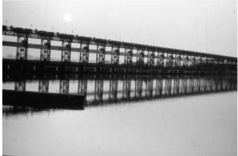
Figure 24. The relatively low, gated dams (barrages) built in South Asian rivers to divert water for irrigation and to control flooding have had major consequences for river dolphins. Not only do barrages interrupt the dolphins' movements and fragment their populations, but they also degrade the riverine environment in numerous ways. The barrage shown here, Girijipuri in India near the border with Nepal, has isolated a small, upstream group of Ganges dolphins.

them (602) in the 180km segment in Sind province between Guddu and Sukkur barrages (G. Braulik, pers. comm.). The observed density in this latter segment is among the highest recorded for river dolphins anywhere.