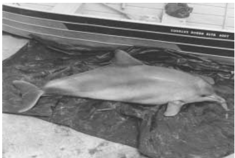
Figure 21. A tucuxi that died from entanglement in a fishing net in Paraná State, Brazil, September 1994.

Living as they often do in close proximity to industrialized, polluted, and heavily populated regions, hump-backed dolphins are exceptionally vulnerable. A population of more than 1000 animals inhabits the Pearl River estuary (near Hong Kong), one of at least eight sites in China that