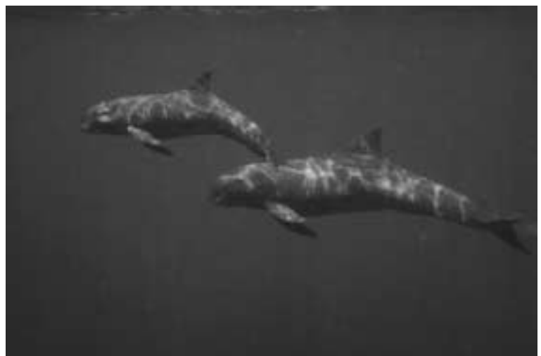
Figure 17. Profile of a pair of pygmy killer whales swimming near Manado Tua, north-western Sulawesi, Indonesia, August 1998. These small whales are relatively common in south-eastern Indonesian waters and can sometimes be confused with juvenile Risso's dolphins.

The southern subspecies has not been exploited on a significant scale; about 200,000 are estimated to occur in waters