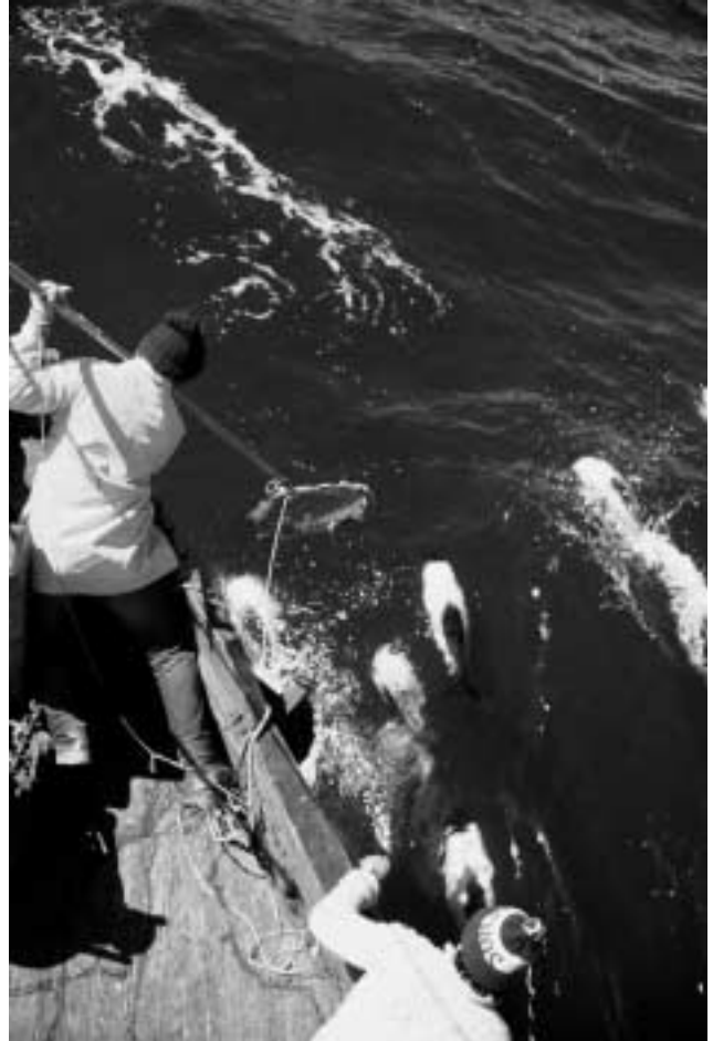
Figure 6. Live-capture of cetaceans for display in oceanaria is a controversial issue. One aspect on which most conservation biologists agree, however, is that any removals from the wild should be within the replacement yield of the wild population, i.e., "sustainable." Commerson's dolphins being netted for oceanaria off the coast of Chile, February 1984.

As a general principle, dolphins should not be captured or removed from a wild population unless that specific population has been assessed and it has been determined that a certain amount of culling can be allowed without reducing the population's long-term viability or compromising its role in the ecosystem. Such an assessment, including delineation of stock boundaries, abundance, reproductive potential, mortality, and status (trend) cannot be achieved quickly or inexpensively, and the results should be reviewed by an independent group of scientists before any captures are made. Responsible operators (at both the capturing end and the receiving end) must show a willingness to invest substantial resources in assuring that proposed removals are ecologically sustainable.