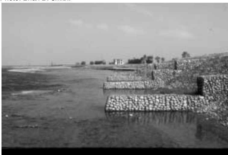
Figure 8. Embankments constructed for questionable flood-control benefits degrade the features that make Asian rivers suitable for supporting freshwater cetaceans and eliminate access to essential habitat for floodplain-dependent fishes and crustaceans.

Appropriation of space by harbor construction, land "reclamation," and mariculture has similarly reduced the available habitat of coastal marine cetaceans. Even though cetaceans may occur in heavily used harbors and be seen regularly in the vicinity of "fish farms" (Figure 9), their health may be at risk. For example, in British Columbia