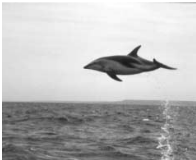
Figure 20. A dusky dolphin breaching high above the surface in Golfo Nuevo, Patagonia, Argentina, November 1999.

Incidental mortality in mid-water trawls off Patagonia in the mid-1980s was estimated at 400–600 dolphins per year, primarily females, declining to 70–215 in the mid-1990s (Dans et al. 1997). At least 7000 dusky dolphins were present along a portion of the Patagonian coast in the mid-1990s (Schiavini et al. 1999). Several hundred continue to die each year in various types of fishing gear off Argentina (Crespo et al. 2000). Some animals are also taken in beach seines and purse seines and by harpooning off South Africa, but the number is not thought to be large. The estimated annual incidental kill of dusky dolphins in fishing gear around New Zealand was within the range of 50–150 during the mid-1980s (Würsig et al. 1997).