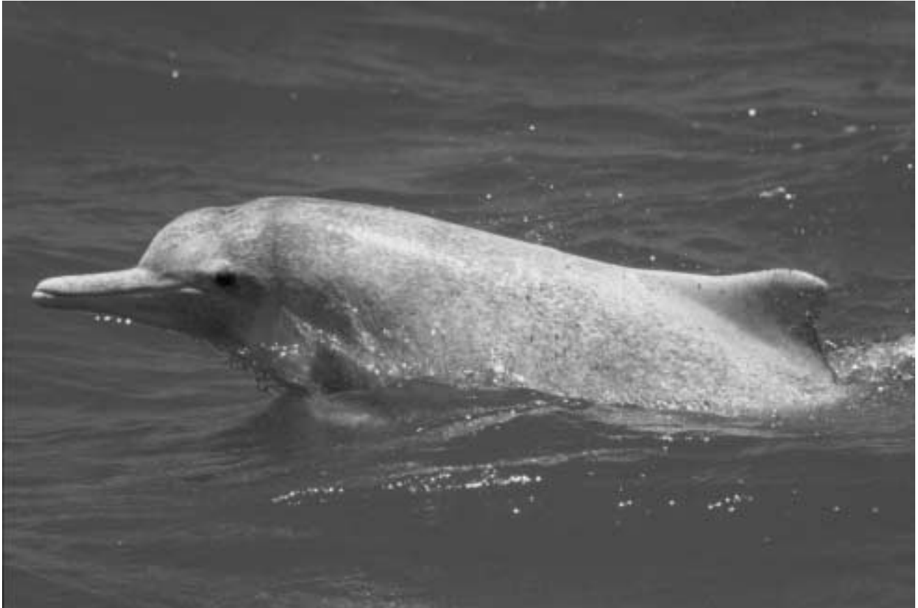
Figure 1. The hump-backed dolphins are distributed in shallow marine waters, mainly near shore and in estuaries. They occur on both the west and east coasts of Africa, along the rim of the Indian Ocean, and along portions of the Pacific coasts of China and Australia (the individual shown here is from Hong Kong waters). Their habitat preferences ensure extensive overlap with human activities in the coastal zone. Improved understanding of this genus's zoogeography and systematics, as well as the abundance and life history characteristics of local or regional populations, is badly needed.

Hector's dolphin and the Davis Strait/Baffin Bay population of bowhead whales from Vulnerable to Endangered (Hilton-Taylor 2000). Two new geographical populations were identified and classified as Critically Endangered: the North Island (New Zealand) population of Hector's dolphin and the Mahakam River (Borneo, Indonesia) population of Irrawaddy dolphins. A number of additional changes were pending at the time of writing, and many species and populations were being reassessed under the new (IUCN 2001) categories and criteria.