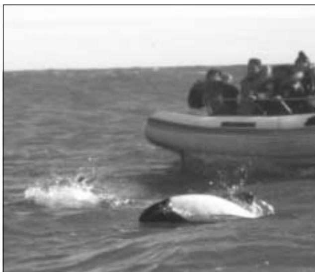
Figure 7. Commerson's dolphins on the bow of an inflatable boat during studies of the effects of such interactions on the animals. Bahia Engaño, Patagonia, Argentina, near the northern limit of the species' range, 1999.

trips to see dusky and Commerson's dolphins ( Lagenorhynchus obscurus and Cephalorhynchus commersonii , respectively) off northern Patagonia (Argentina) (Figure 7) and Peale's dolphins ( Lagenorhynchus australis ) near Punta Arenas (Chile), but neither country has any laws to regulate this activity and limit its impact on the animals (Crespo, unpublished data). Whale-watching centered on southern right whales has flourished for the last 30 years in coastal Patagonia, where it has become the most important local tourist attraction (Rivarola et al. 2001). Incipient whale-watching industries along the Spanish Mediterranean coast and near the large tourism centers in south-eastern and north-eastern Brazil are expected to develop rapidly in coming years. Although there is little evidence to indicate that whale-watching has had negative effects on cetacean populations (IFAW, Tethys Research Institute and Europe Conservation 1995), one of the priorities of the IWC Scientific Committee's Sub-committee on Whale-watching is to examine the short- and long-term effects of tourism on cetacean populations and to develop general principles for minimizing these (IWC 1999a et seq. ).