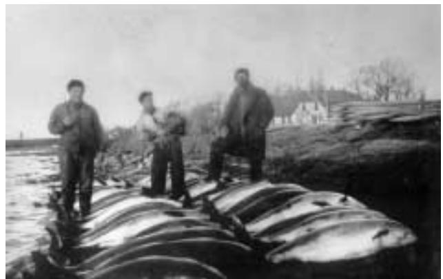
Figure 2. Harbor porpoises were killed in large numbers (up to 3000 in a single year) in a Danish drive and net fishery from the sixteenth century until the mid-twentieth century. This photograph was taken near Middelfart, inner Danish waters between the Baltic and North seas.

The small and medium-sized cetaceans have been taken for hundreds of years (Figure 2), and they continue to be taken in many areas for food, oil, leather, bait, and other uses. In Japan, for example, the drive fishery for small cetaceans led to a dramatic decline in the abundance of striped dolphins ( Stenella coeruleoalba ) by the early 1980s (Kasuya 1999c). This decline prompted fishermen to change their target species to killer whales ( Orcinus orca ) and bottlenose, pantropical spotted, and Risso’s dolphins ( Tursiops spp., Stenella attenuata , and Grampus griseus , respectively) to supply the profitable Japanese market for small cetacean meat (Kishiro and Kasuya 1993). In the Arctic, monodontids were over-exploited historically by