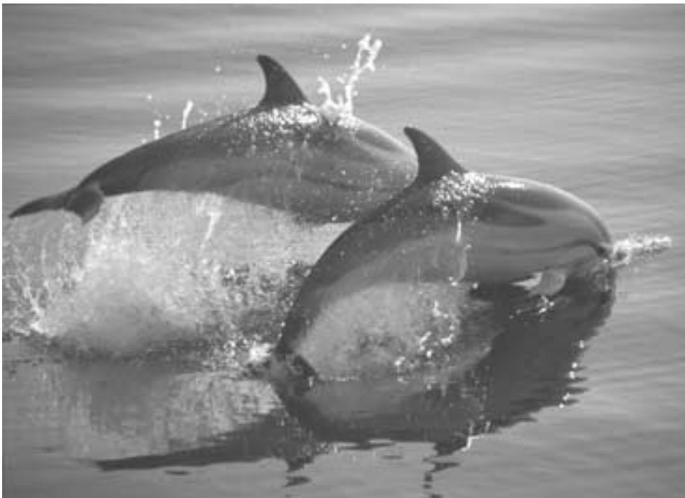
Figure 11. Striped dolphins are the most abundant cetaceans in the Mediterranean Sea, including the Ligurian Sea Cetacean Sanctuary. Their bold markings make these animals relatively easy to identify.

A workshop sponsored by the International Whaling Commission (IWC) in 1996 placed the issue of climate change, including ozone depletion, firmly on the cetacean conservation agenda (IWC 1997b). Effects of climate change are complex and interactive, making them analytically almost intractable. The workshop report acknowledges the difficulties of establishing direct links between climate change and the health of individual cetaceans, or indirect links between climate change and the availability of cetacean prey resources. It emphasizes the precautionary principle and urges action to reduce emissions of ozone-depleting chemicals and greenhouse gases. Physical changes in sea ice and freshwater discharge are well advanced and ongoing in polar regions, and these changes are probably already influencing ocean productivity, human activities, and contaminant flux, all of which have implications for cetacean populations (e.g., Tynan and DeMaster 1997). Many of the most threatened cetacean populations are in temperate and tropical areas where the manifestations of climate change, such as greater frequency and severity of storms, flooding, and drought, will exacerbate resource-use conflicts between people and wildlife. A particular problem relates to the effects of altered discharge regimes in the Asian and South American rivers inhabited by cetaceans (Würsig et al. 2001).